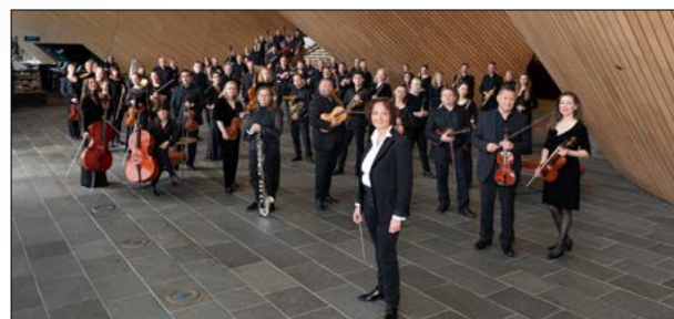
Kristiansand Symphony Orchestra